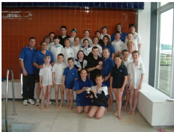
Mini League Champions 2004